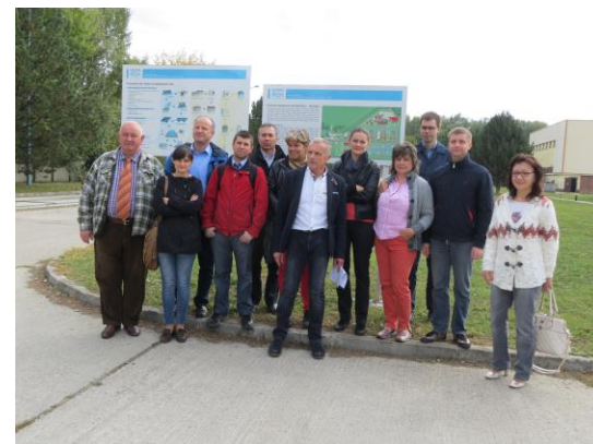
Moldavian, Ukrainian experts in Slovakia, Sept 2015