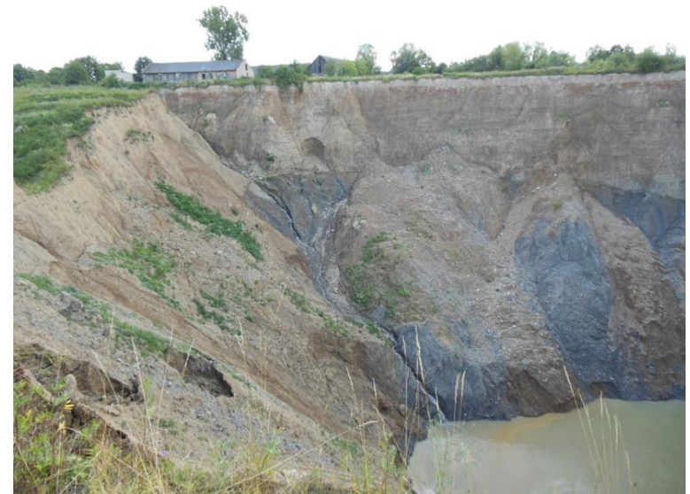
Solotvino salt mine