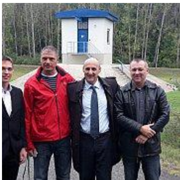
Bosnian expert seconded in Hungary for two weeks Sept 2015, Moldavian, Ukrainian experts in 2014 from HU government funds