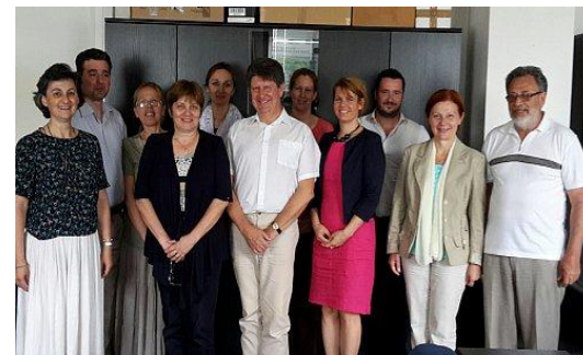
Visit to Serbia July 2015

Association Justice & Environment 20 December, 2013