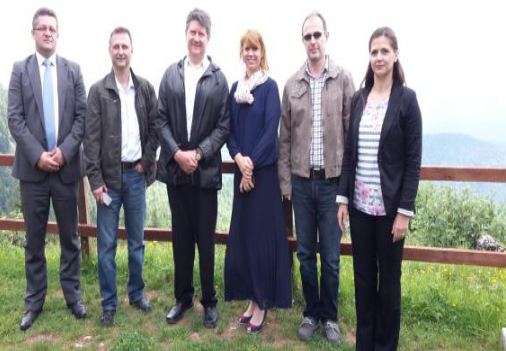
Visit to Bosnia June 2015