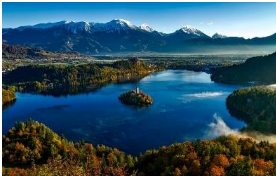
Lake Bled, Slovenia